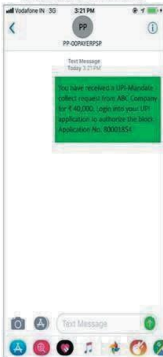
Block request SMS to investor